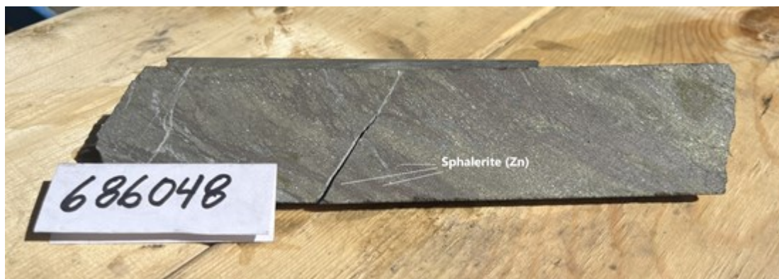
Figure 2: Sample #686048 (Zone 2) - Sphalerite Bands within VMS, (1.09% Cu, 20.37% Pb-Zn, 51 g/t Ag, .78 g/t Au)

To view an enhanced version of this graphic, please visit: