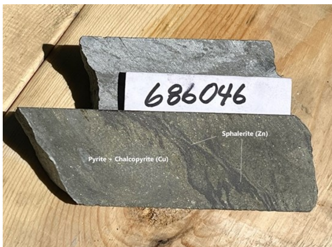
Figure 1: Sample #686046 (Zone 2) - Sphalerite & Chalcopyrite Bands, (1.6% Cu, 2.08% Pb-Zn, 19 g/t Ag, .54 g/t Au)

To view an enhanced version of this graphic, please visit: